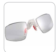
Optical insert Ref. IRISRXXKIT