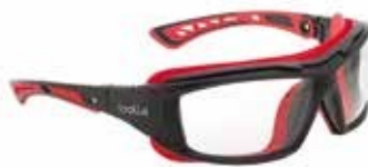
Worn as spectacle with temples kit