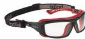
Worn as spectacle with temples kit and retainer strap (option)