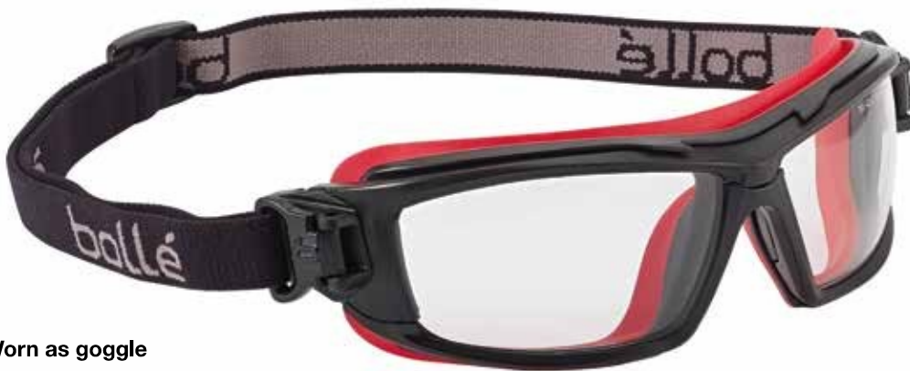
Worn as goggle