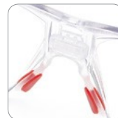
3 positions nose B FLEX