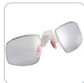
Optical insert IRISRXKIT