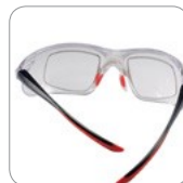
Bi-color & bi-material temples