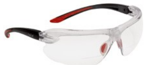
VERSIONS WITH READING AREA : +1.5 : IRIDPSI1,5 +2 : IRIDPSI2 +2.5 : IRIDPSI2,5 +3 : IRIDPSI3